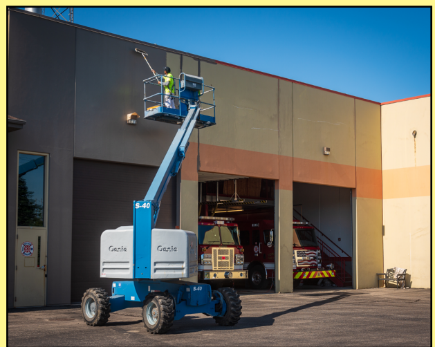
Employees of JDR Painting have been hard at work repainting and fixing the concrete of the Somers Fire & Rescue and Public Works departments.