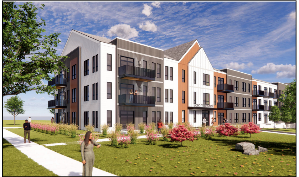
The Maples of Somers is a large housing project located on the former Maplecrest Golf Course property. It will feature a mix of housing with apartments, single-family and twin homes.

■ Single-family homes — Four single-family homes are currently under construction in Somers.