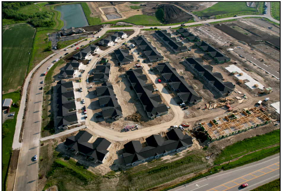
Apartment buildings and a clubhouse are currently under construction at the Savannah at Pike Creek development. It is located at the corner of Green Bay Road and Highway L.