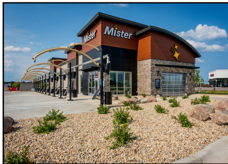
Mister Car Wash