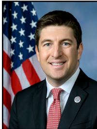
U.S. Rep. Bryan Steil

■ U.S. Rep. Bryan Steil's office hours are now in room 177 of the Kenosha County Building, 19600 75th Street, in Bristol.