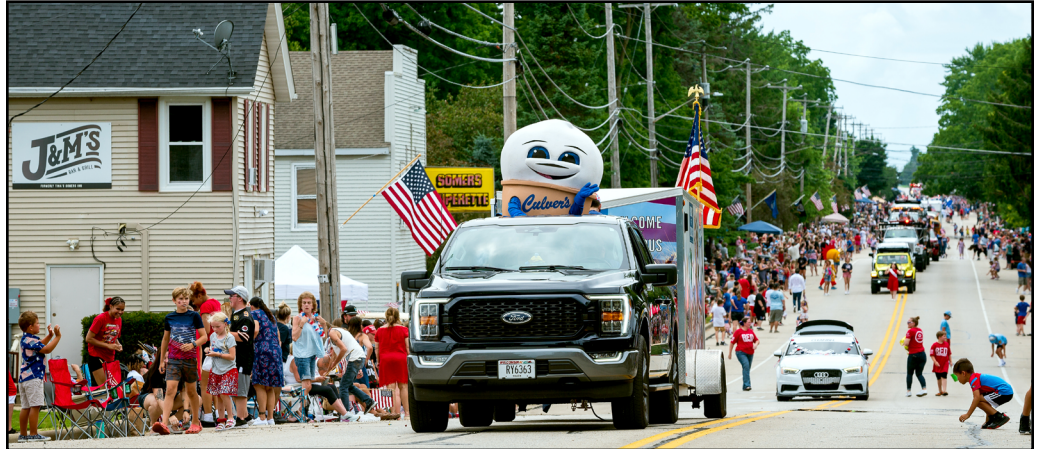
Thousands lined the street of downtown Somers to see about hundred entries in the Somers parade.