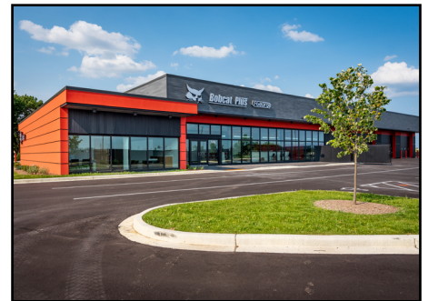
Bobcat Plus dealership