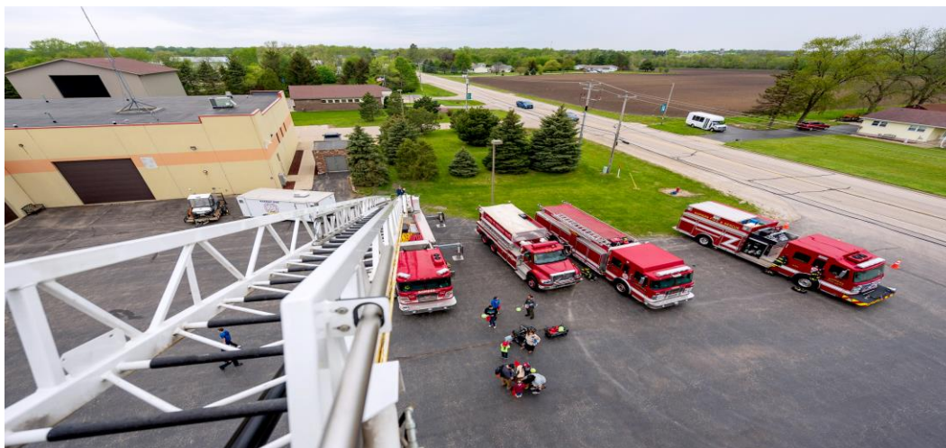
Somers Community Day 2023