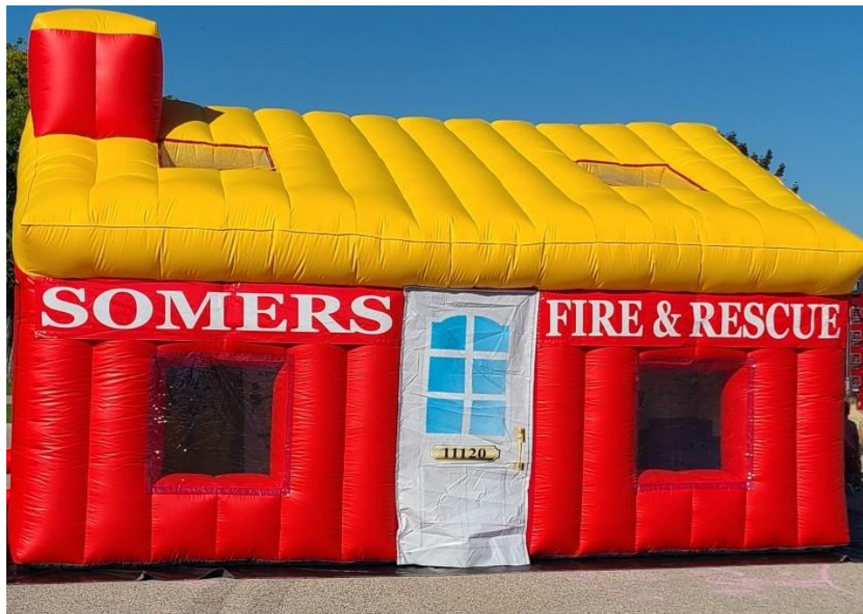
Inflatable Fire Safety Education House