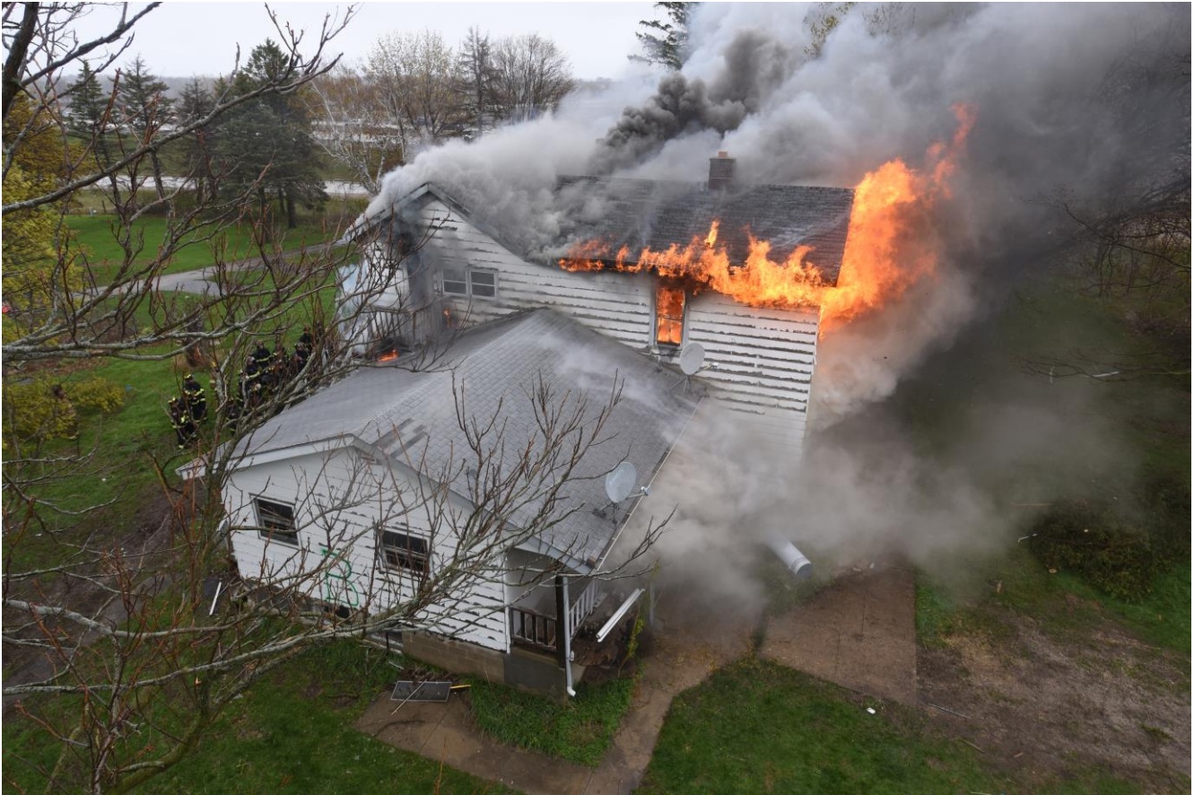
Live Fire Training at Donated House

Respectfully Submitted, Training Captain Aaron Strom