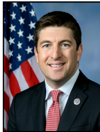
U.S. Rep. Bryan Steil

■ U.S. Rep. Bryan Steil's office hours are now in room 177 of the Kenosha County Building, 19600 75th Street (at the corner of Highways 45 and 50).