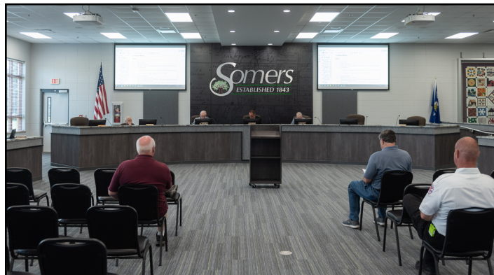
The August 14 Town Board meeting was the first meeting held in the newly remodeled auditorium.

For additional questions, call the fire department at 262-859-2277.