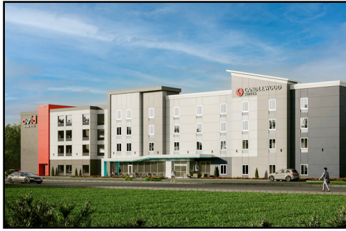
Hotel architect drawing

To learn more check out mission94firearms.com .