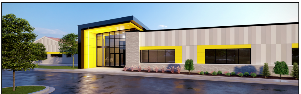
Shoreland Lutheran High School architect rendering of the main entrance