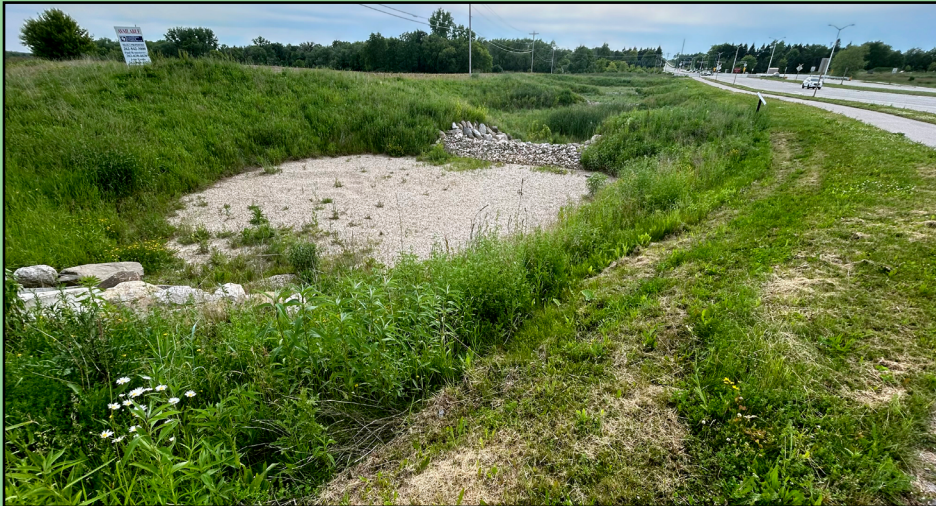
The stormwater system located at the southwest corner of the intersection of Green Bay Road and Highway KR is a regenerative conveyance system which is designed to improve infiltration and limit footprint and maintenance costs.

The Root-Pike Watershed Initiative Network and the Wisconsin Department of Natural Resources recently held a webinar focused on the best practices and innovations of stormwater ponds.