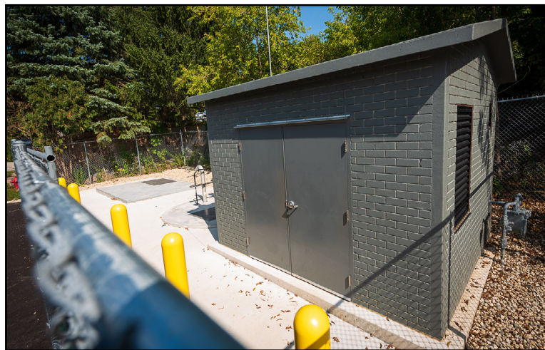
Both the Eaglewood Lift Station, left, located on 45th Avenue, and the Lichter Lift Station, below, located on 64rd Avenue, have now been completely remodeled.

Service was maintained during the construction project.