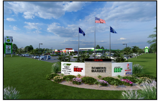
Proposed Service Center architect drawing